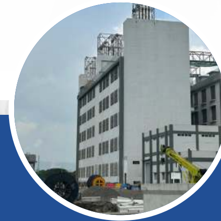
Fairfield Marriott, Indore

Electricals for Furnace, Batch House & Cabling