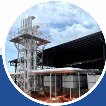
All India Institute of Ayurveda, Goa